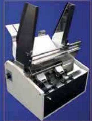
OPTIONAL: FF309 Feeder For better performance