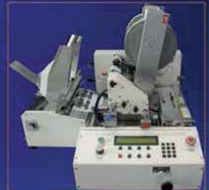
Feeder FF 309 is designed just for tabber ATS 309 . System is fully synchronized.