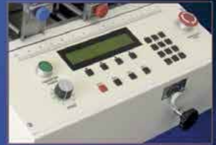
Well organized and easy to use Control Panel

Specifications are subject to change without notice.