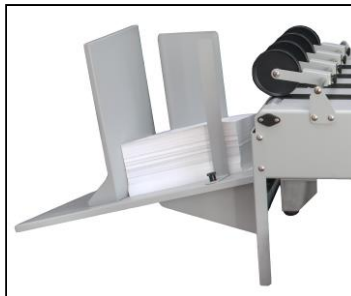
Conveyor Runs Right to Left